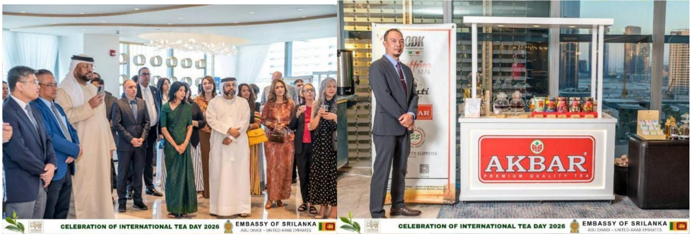
CELEBRATION OF INTERNATIONAL TEA DAY 2026 EMBASSY OF SRILANKA ABU DHABI - UNITED ARAB EMIRATES