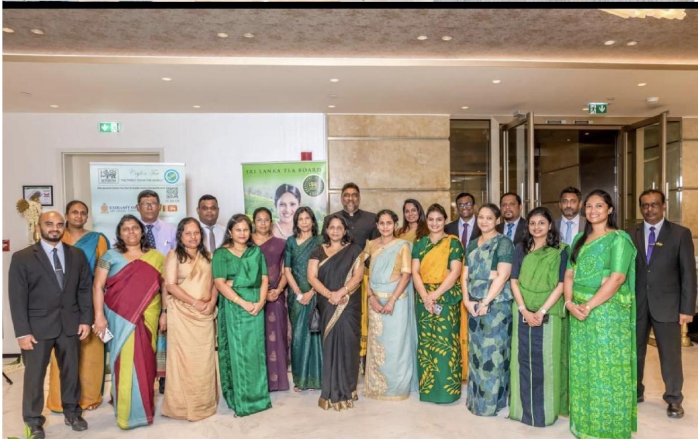
CELEBRATION OF INTERNATIONAL TEA DAY 2026 EMBASSY OF SRILANKA ABU DHABI - UNITED ARAB EMIRATES